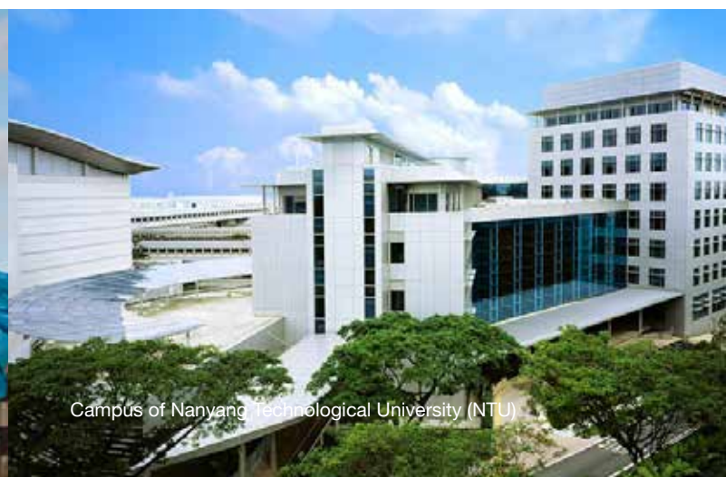
Campus of Nanyang Technological University (NTU)