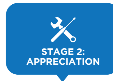
7-Day Trip To Germany